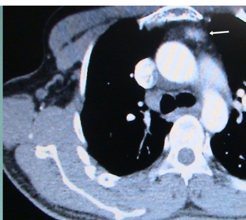
Figure 1. Display at L2 – L4 levels of bone densitometry consistent with osteoporosis (Z score: - 2.8) Figure 2. Display of activity (arrow) involvement at anterior mediasten on Tc99-m MIBI (A) 36x15x15 mm sized; well-circumscribed; smooth countoured solid lesion (arrow) at similar density with thyroid gland (B)